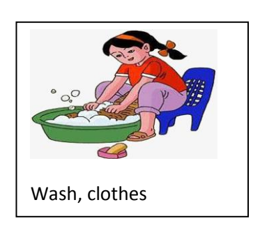
Test-03 Look at the pictures. Write what Ruchira's mother will have completed by the end of the day.