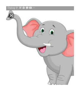
It has a long trunk