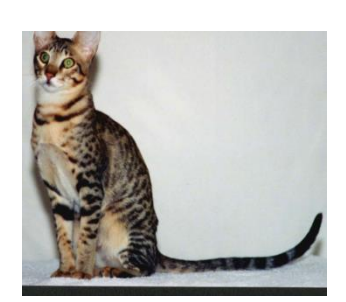
It has a long tail