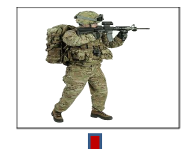
A regiment of soldiers