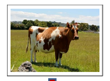
A herd of cows