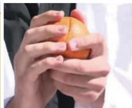
Figure 8.12 ▲ Replicate plate tectonics using an orange