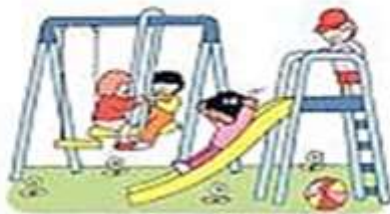
At the Park

It is Saturday. I am going to the park. My father and mother bring me and my brother and sister to the park during the weekend. We play at the swing and the slides. We run and play with the ball with other kids. We buy ice cream and candy at the park. We are very happy.