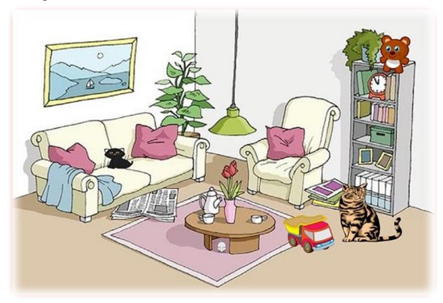
Ex: There is a flower vase on the stool.

from the following picture. You have to describe the position of the given objects in relation to the other objects in the picture.