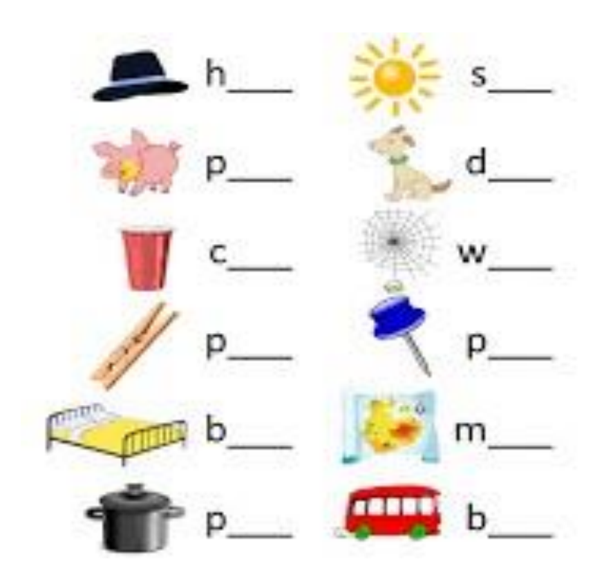
Activity – B

Do activity -12 and activity-13 on page 21 of your English Pupil's book.