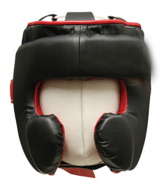
Figure 6.6 - Head gear for Boxers

While participating in sporting events, the participants meet with various accidents. These accidents could happen due to several reasons such as the manner in which the game is played, the type of equipment used etc. Therefore, standards have been defined through rules with regard to the use of equipment and participants cannot use equipment as they wish. Rules define the manner in which the participants should play the game.